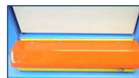
Optional Heavy Duty Foot Stop