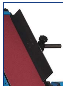
Optional Side Work Rest