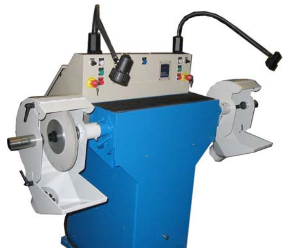
Powerfin Bull , double-ended polisher, with optional lights