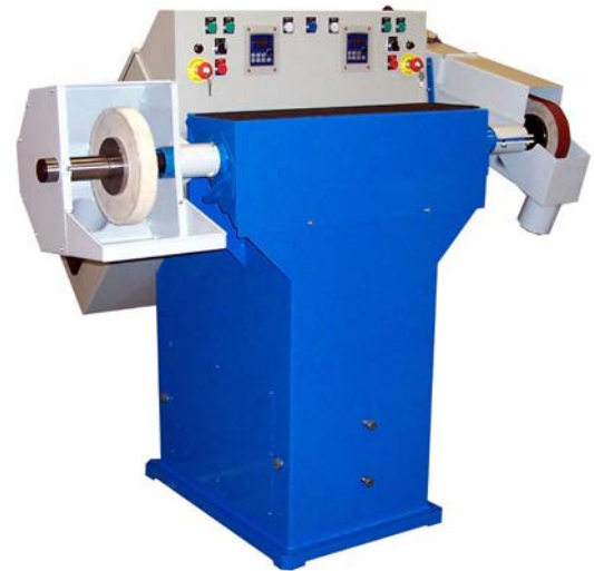
Powerfin Bull , combined polisher and belt grinder

* Please note that these items are factory fitted at the point of manufacture