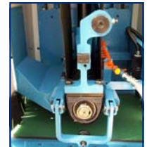
Gate Open to Accept Belt