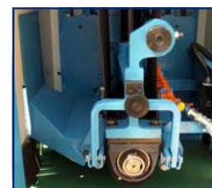
Gate Closed in Running Position