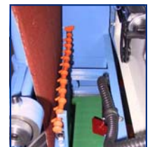
Spray Bar System