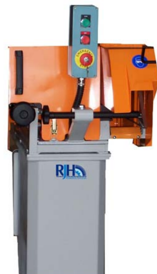
Powerfin 1060 mounted on a pedestal