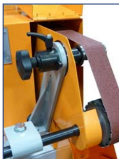
Belt System (Guard Open)