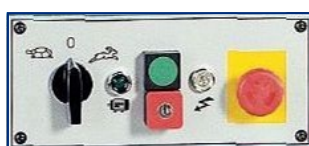
Twin Speed Electric Controls