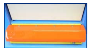
Optional Heavy Duty Foot Stop