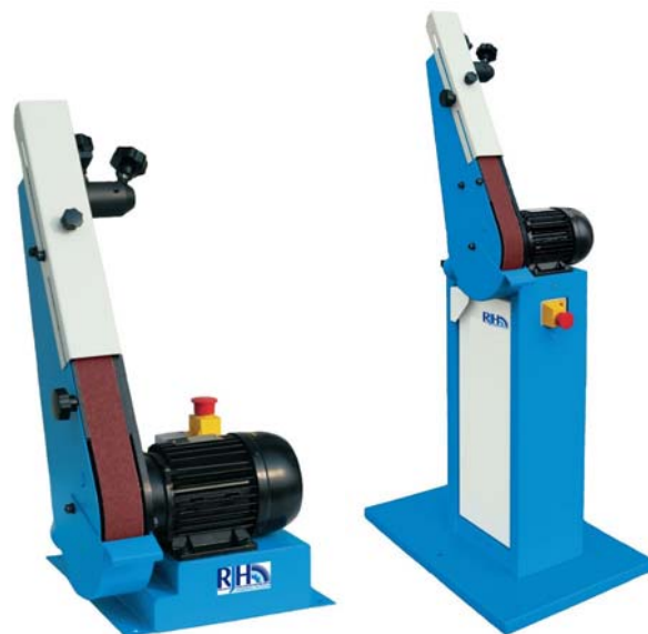
MUA86 (Bench) & MUA87 (Pedestal)

* Please note that these items are factory fitted at the point of manufacture