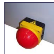
Optional Standard Foot Stop