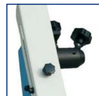
Tensioning & Tracking Controls