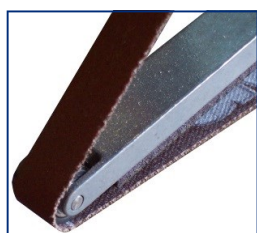
Optional Turbine Arm