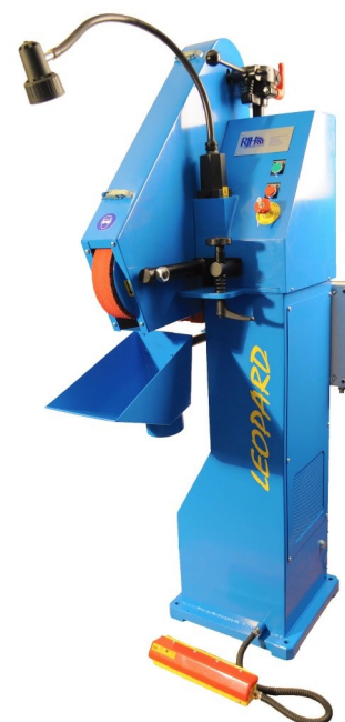
Powerfin Leopard Series, shown with optional light and heavy duty foot stop