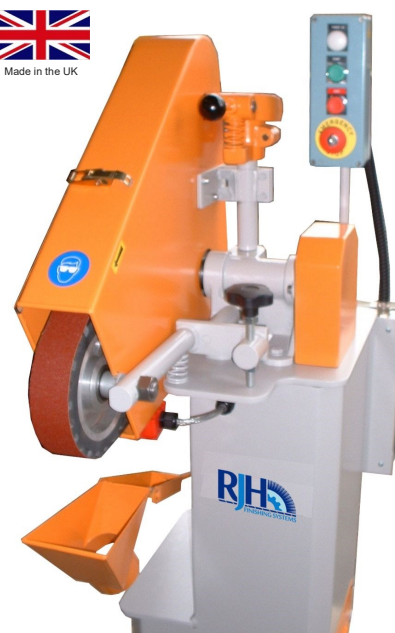
Leopard LD Series