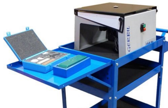
Gerbil 2030 shown with optional shelf