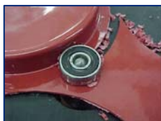
Tungsten Carbide Flange Cutter