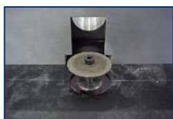
Dust Extraction Fence