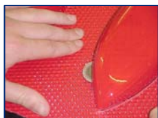
TC Abrasive Disc