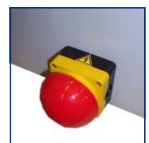
Optional Standard Foot Stop