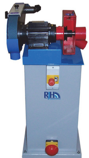
Fallow, FAA82P, shown with optional foot stop