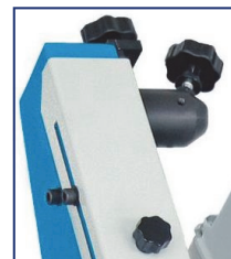
Tensioning & Tracking Controls