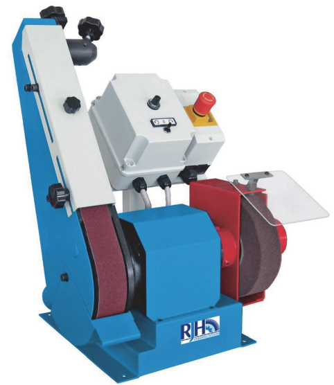
Fallow, FAA82, shown with optional variable speed