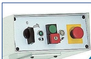
Single Speed Electric Controls

* Please note that these items are factory fitted at the point of manufacture