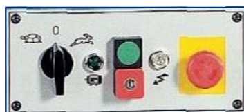
Twin Speed Electric Controls