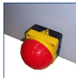
Optional Standard Foot Stop