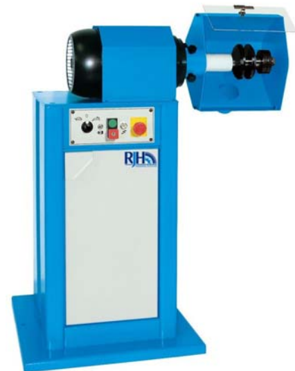
Buffalo BOA66 & BOA74