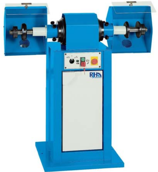
Buffalo BOA27 & BOA46

* Please note that these items are factory fitted at the point of manufacture